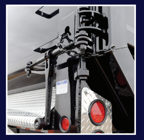
Ratchet-Operated Side Latch Allows for easy opening and closing operation.