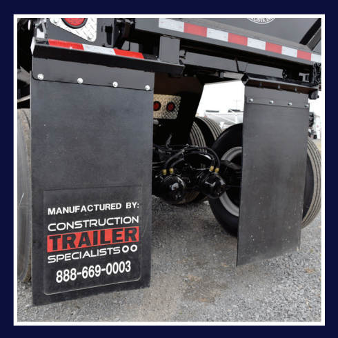
Rotating Rear Mud Flap Ensures the door is not bent during dump cycle.